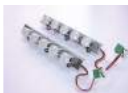
12172A73 Optical Unit - Phototherapy and Illumination Leds (2pcs)