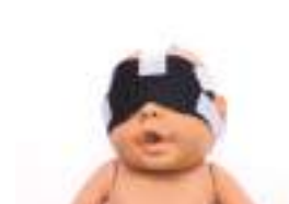
12423A70 Phototherapy Mask (50pcs)