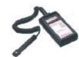
1749 Radiometer RM400