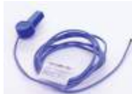
11730A73 Blue Skin Probes (6pcs)